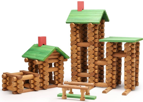
Fig. 1. Sample Lincoln Logs structures.