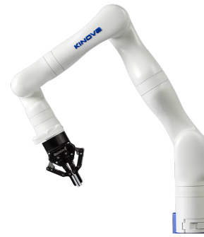
Fig. 3. A Kinova v3 Arm, utilized for this project

This program was then run on the Kinova v3 Arm (depicted in figure 3), found in the JP Morgan Chase & Co. AI Makerspace in the Tepper Building on Carnegie Mellon’s campus. In order to run the program itself, a sequence of coordinates was given - Cartesian x , y , and z as well as relative angles \theta_x , \theta_y , and \theta_z . Initially, the coordinates were found with manual teleoperation, finding points necessary for developing the first two layers of the Lincoln Log structure. With the key coordinates known for pick-and-place actions, as well as the distance between layers in the structure, we created a list of trajectories using the custom XML generator. The robot’s user interface, which was opened with a connection to the arm’s IP address, imported the XML and ran the motions necessary to translate the arm to the desired positions and orientations.