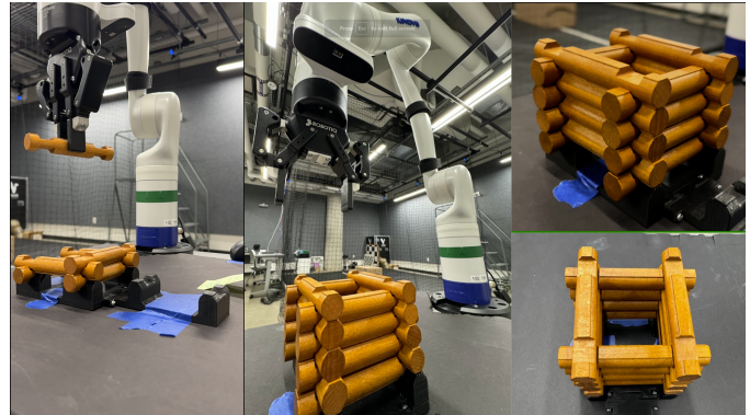
Fig. 4. Left - Image taken during build process. Right - Completed structure.